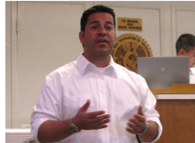
Congressman Ben Ray Lujan

The first speaker was Congressman Ben Ray Lujan. He gave us examples of how the U.S. has gone from a manufacturing nation to just a nation of consumers such as how cell phones were developed and created in this Country, but last year the amount of cell phones made in this Country was exactly zero. Congressman Lujan also told the Delegates about an amendment he offered to open previously off-limits areas to oil drilling provided that the oil would only be refined and sold in the U.S. and how the amendment was voted down in Washington. The Congressman also told us the F-35 Joint Strike Fighter that was supposed to go to Holloman was now going to Arizona. He said that when he made inquiries about the change, no one could give him an explanation as to why. Congressman Lujan informed us about pending Free Trade Agreements with Columbia, Panama and South Korea and how they would further erode the jobs in the U.S. The voting on these trade agreements will be in the September 15 th -20 th timeframe in Washington.