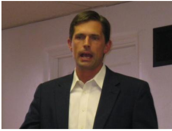
Congressman Martin Heinrich

U.S. Congressman Martin Heinrich took time to come down from D.C. to talk with the Delegates. He told us about how some in Washington have what the Congressman calls a “Full Employment Minimum Wage Plan”. He explained that their idea is that corporations and companies would hire more workers if they only had to pay minimum wage to those workers.